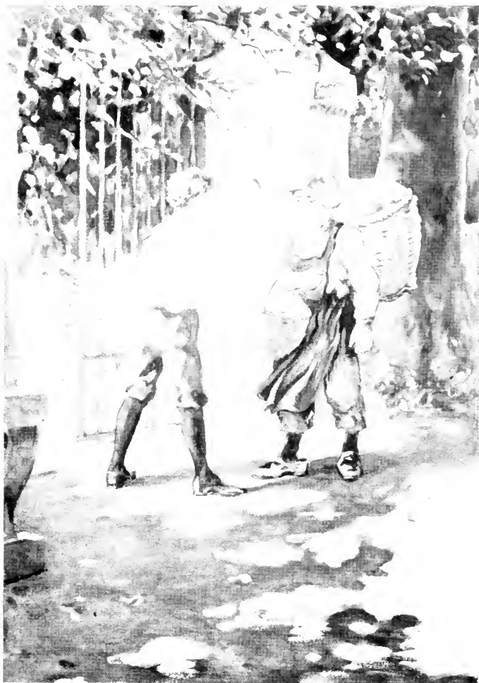
OSCAR WAS AT THE GATE WAITING FOR THE BAKER'S BOY